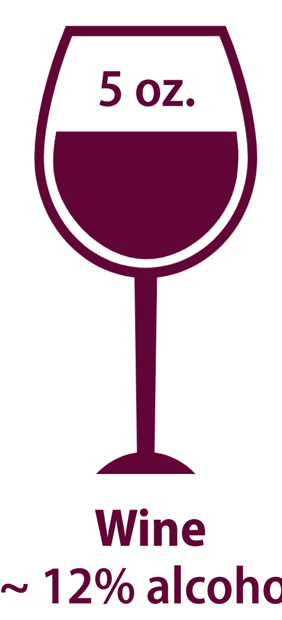
~ 12% alcohol